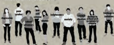
Consequences of Bullying

Bullying violates these character traits by using: Intentionally Hurtful Words/Writing • Negative Behavior • Physical/Verbal attacks Exclusion/Social Isolation • Sexual Harassment/Discrimination